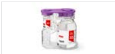
HyQvia vial(s) The number of vials you will have will depend on your prescribed dose.

It may seem a bit overwhelming at first, but this guide will walk you through the supplies you'll be using and the infusion process. Something to know – the supplies that you receive from your pharmacy may look different, and that's OK. Supplies may vary based on what brands the specialty pharmacy has in stock.