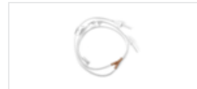
Gravity fill set with vented spike and sterile cap