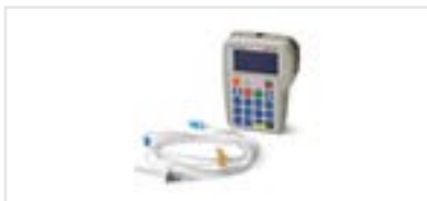
Peristaltic infusion pump, pump tubing, power supply, and manual