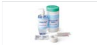
Alcohol swabs, antibacterial cleaner, soap, tape, and bandages. Gloves can be used if recommended by your doctor