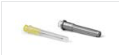
Needle or needle-less transfer device*—1 per HyQvia vial