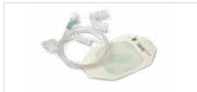
Subcutaneous needle set with a clear dressing—1 per infusion site