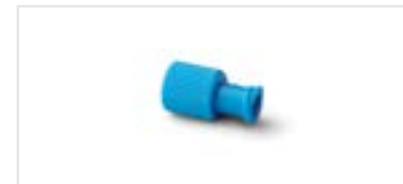
Sterile tip caps—1 per syringe