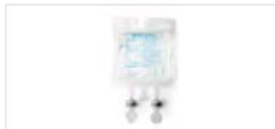
Optional: Saline infusion bag (if required by your doctor)